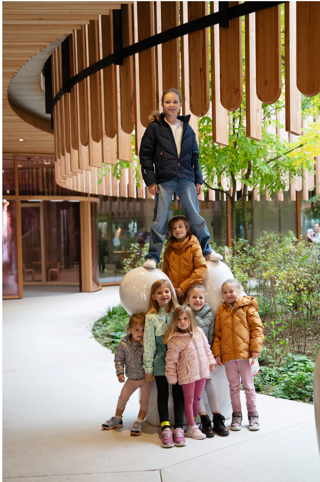
University Children's Hospital Zurich designed by Herzog & de Meuron