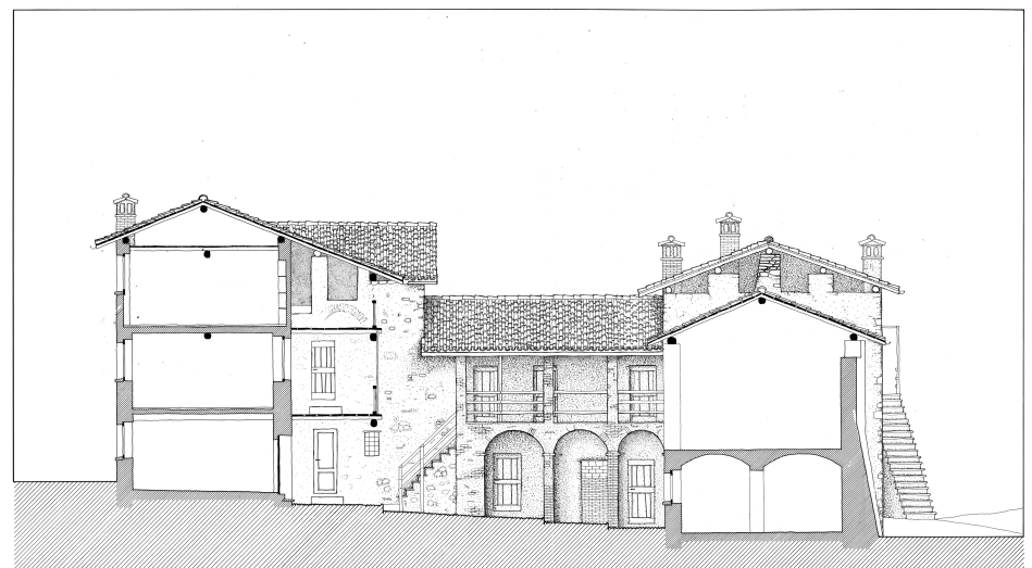
Detached courtyard house in Novazzano (Ticino), 1. est facade 2. nord facade 3. and 4. sections, 1:100