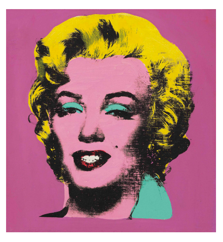
Sturtevant, Warhol Marilyn, 1965